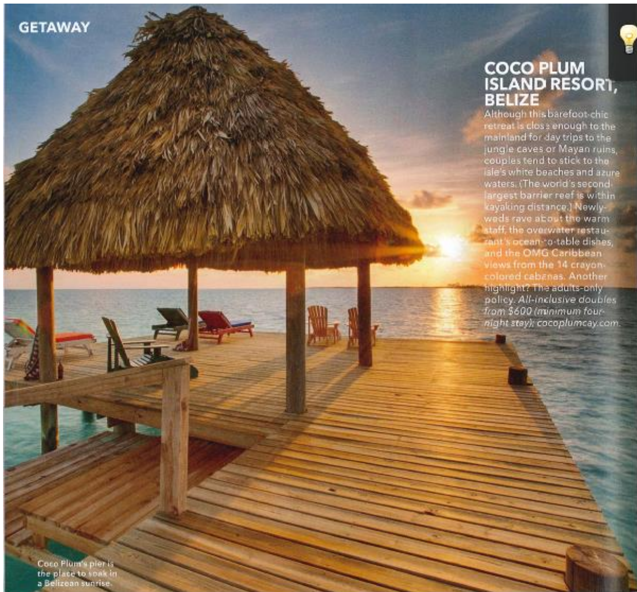
Coco Plum's pier is the place to soak in a Belizean sunrise.

Although this barefoot-chic retreat is close enough to the mainland for day trips to the jungle caves or Mayan ruins, couples tend to stick to the island's white beaches and azure waters. (The world's second-largest barrier reef is within kayaking distance.) Newlyweds rave about the warm staff, the overwater restaurant's ocean-to-table dishes, and the OMG Caribbean views from the 14 crayon-colored cabanas. Another highlight? The adults-only policy. All-inclusive doubles from $600 (minimum four-night stay); cocoplumcay.com.